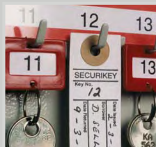
Sign Out Tab