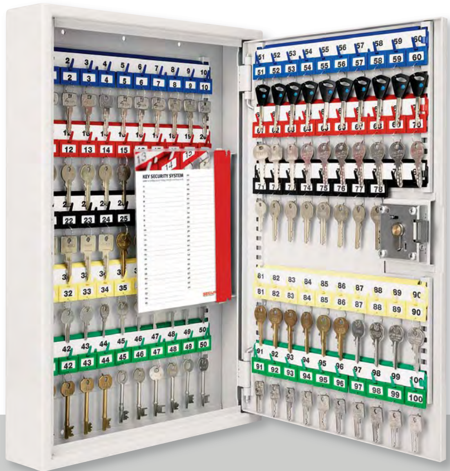
Key Vault 100

Designed to meet the requirements of insurance companies in the control, tracking and security of keys associated with risk to valuables or property, our range of Key Vaults offer twice as much security and strength provided by standard key cabinets. Constructed from 2.5mm fabricated steel with a 3mm flush closing door which includes removable hinge pins for easy upgrading, they are ideal for commercial use. These cabinets are also supplied as standard with a half euro profile cylinder that can be upgraded to integrate with an existing master key or security system. As with the System cabinets, the Key Vault has adjustable hook bars, a removable control index, sign-out tabs (to record a paper trail of key usage) and is also available in a deeper model for the storage of bunches of keys.